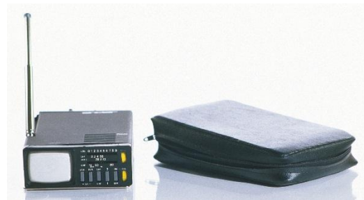
Sinclair MTV-1 Microvision Television, United Kingdom, 1980.